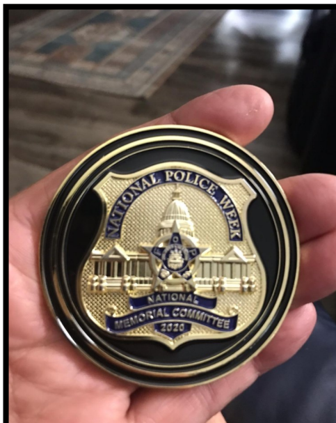
Memorial Coin from 2020