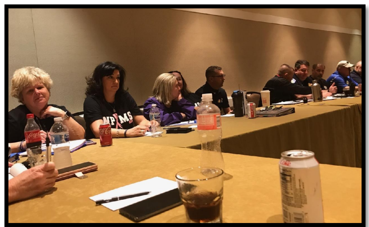
Meeting at the Host Hotel with COPS