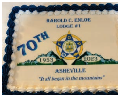
Photo of Lodge 1's 70th Anniversary Celebration Cake